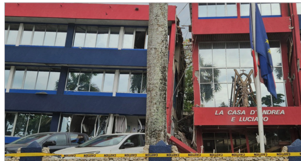
Figure 3 – Embassy Building at European Corner, damaged beyond repair and now demolished.

build knowledge from this disaster for future resilience, if they engage with the clients and firms involved.