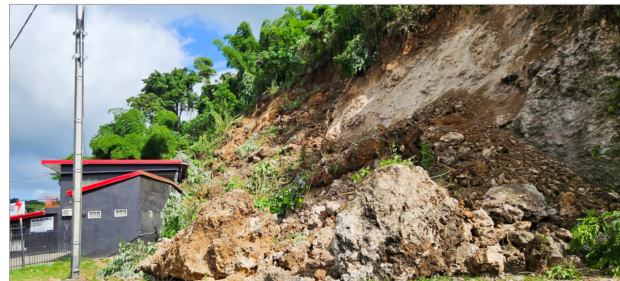
Figure 1 – Landslides to the vertical faces beneath George Pompidou area.

Landslides were a major visible feature of the earthquake's effects around the Port Vila basin. Significant geotechnical and geological survey will be required to assess the stability of these slopes and the mitigation of present hazards. Ideally the Ministry of Public Works and Utilities (MIPU) would be co-ordinating this, as geological models are expensive to establish and several different engineering firms are now building their own, at the behest of their various clients. This information will not be publicly available, even for government. This is just one example of the opportunity that exists for MIPU to