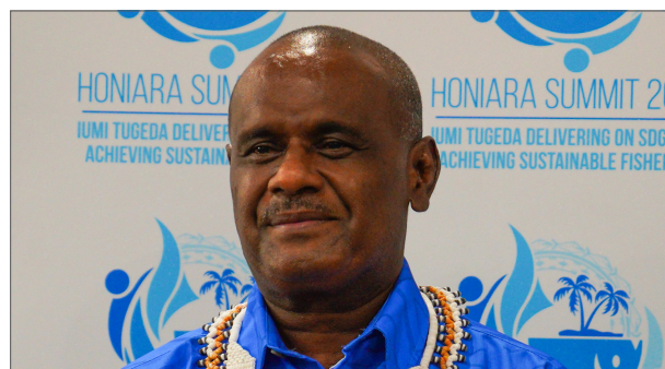
Solomon Islands Prime Minister Hon. Jeremiah Manele

“These threats are not just environmental issues—they are existential challenges for our communities, economies, and way of life,” Manele said. “The Pacific’s dependence on fisheries means that any decline in the health of our oceans directly impacts our people.”