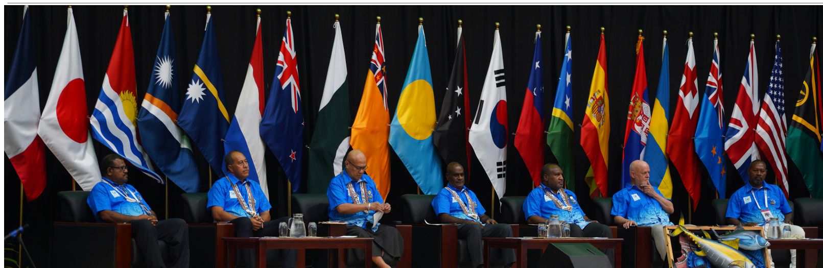
Pacific Island leaders at the Summit.