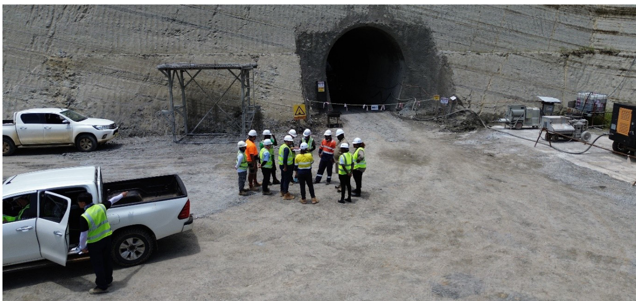
HEC Engineers explaining the construction of the tunnel portal captured by the project team.