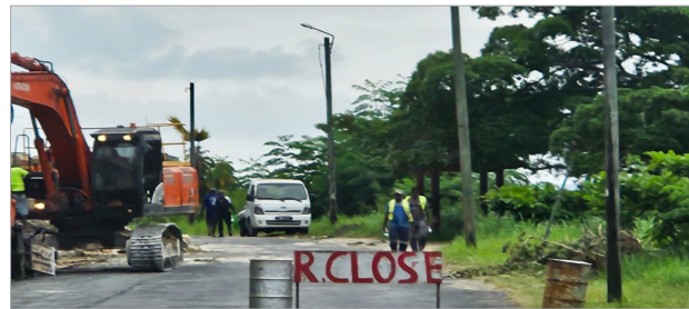
Figure 2 – Damage to power lines.