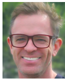
By DAVID SPRING PT COLUMNIST Sydney, Australia

Like the prophets of old, forecasting the future is fraught. It is more than just googling a list of events to attend, networks to build, and bids to write.