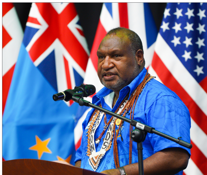
PNG Prime Minister, Hon. James Marape.